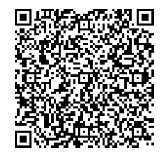
Go to > rebrand.ly/pathwaypledge

For questions, contact Bob Fois at: bqf2@westchestergov.com / 914-995-4976