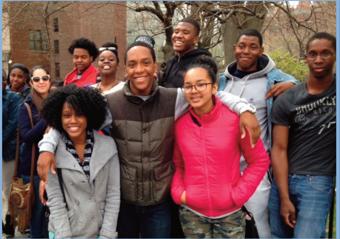
WWDAY Students attend a STEM exhibit at the Museum of Natural History in April 2014