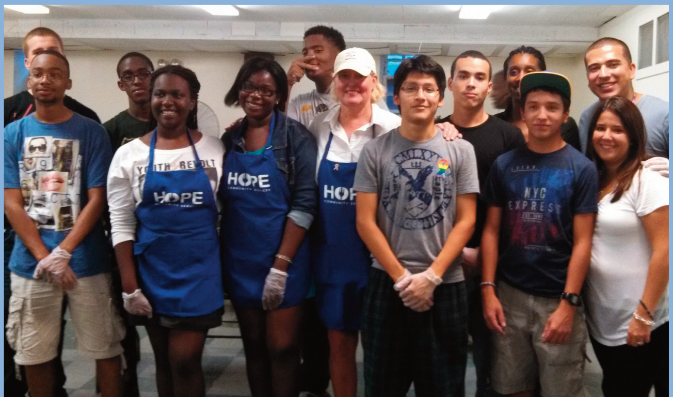
New Rochelle WWDAY students participating in community service.

This federally funded youth workforce initiative awarded to the WIB from STRIVE National provides educational and employment services for Yonkers based youth having prior or present involvement in the juvenile justice system, ages 14-24. Those youth 14-17 the goals are to provide educational and counseling support to enable them to achieve their high school diploma and advance into higher education and employment. For the youth 18-24 services are provided to achieve their GED, obtain employment and/or advance into higher education. The program offers workforce development, educational training, case management, mentoring, restorative justice projects and community service. The grant began in 2013 and continues through 2015.