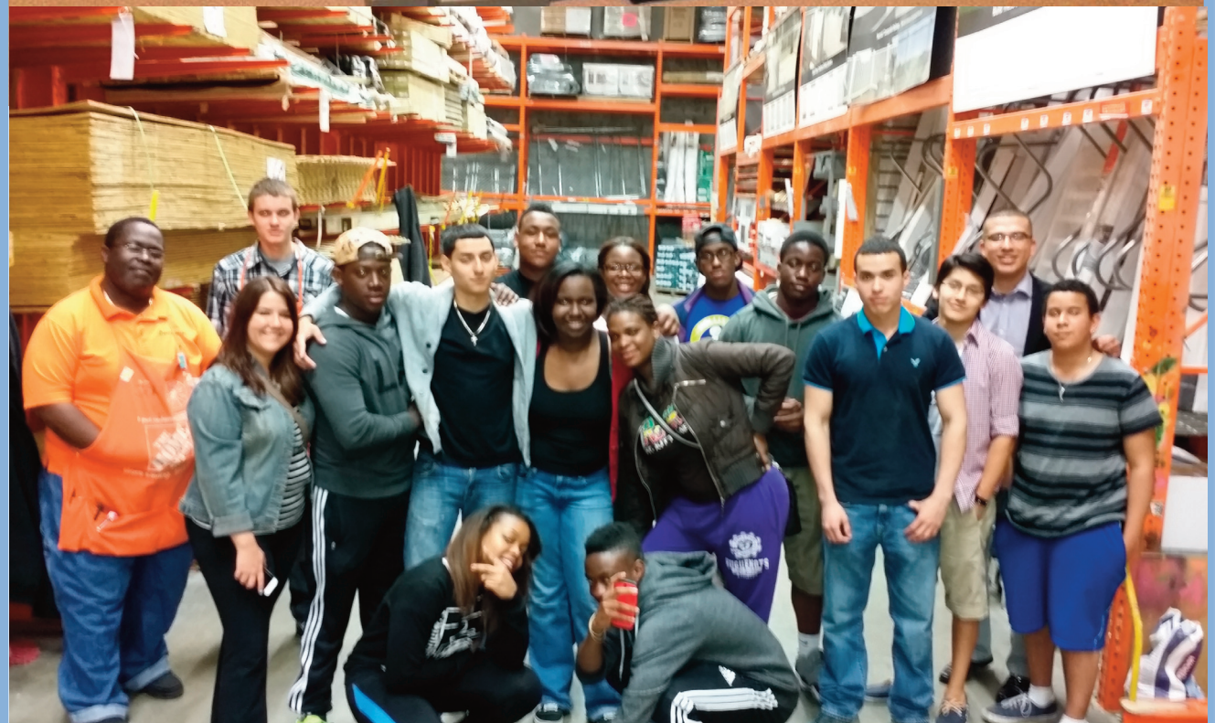
Top: Westchester County's Private Sector Summer Jobs Initiative kickoff event hosted at The Digital Arts Experience. Home Depot provided supplies for a community Service project.